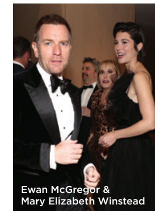
Ewan McGregor & Mary Elizabeth Winstead