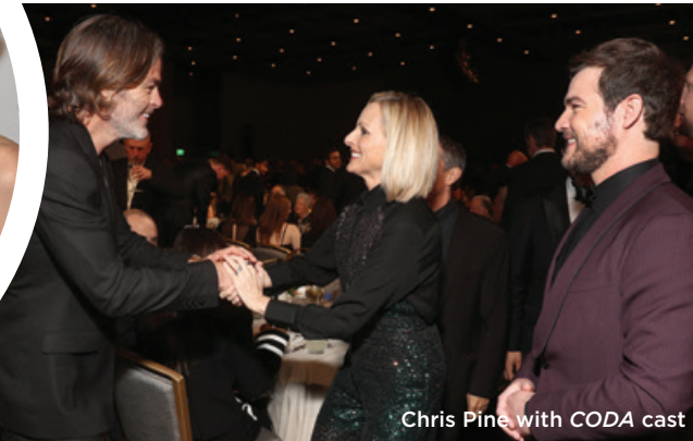
Chris Pine with CODA cast