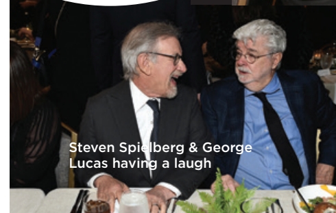
Steven Spielberg & George Lucas having a laugh