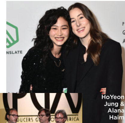
HoYeon Jung & Alana Haim