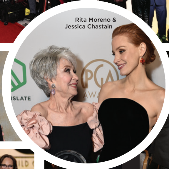
Rita Moreno & Jessica Chastain