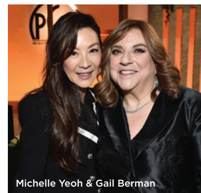
Michelle Yeoh & Gail Berman