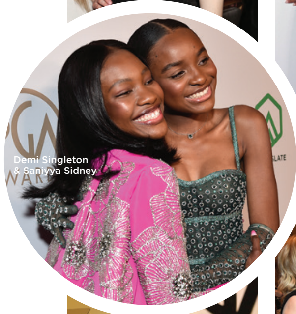
Demi Singleton & Saniyya Sidney