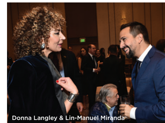
Donna Langley & Lin-Manuel Miranda