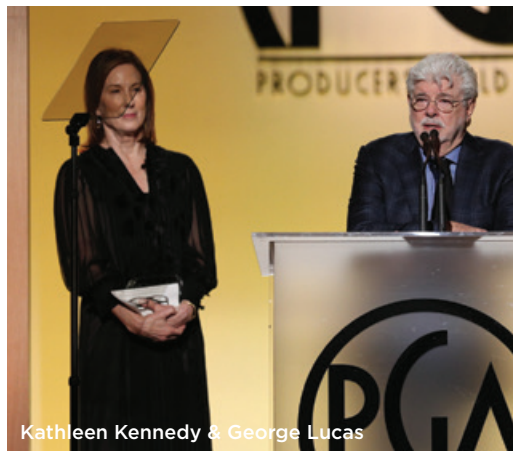
Kathleen Kennedy & George Lucas