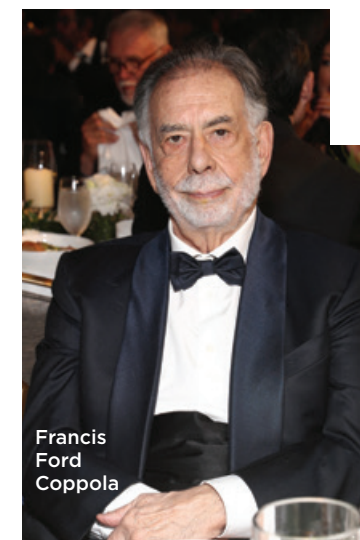
Francis Ford Coppola