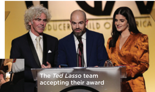
The Ted Lasso team accepting their award