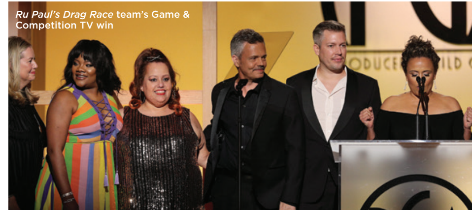
Ru Paul's Drag Race team's Game & Competition TV win