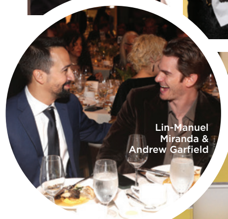
Lin-Manuel Miranda & Andrew Garfield