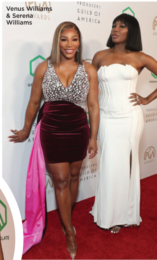
Venus Williams & Serena Williams