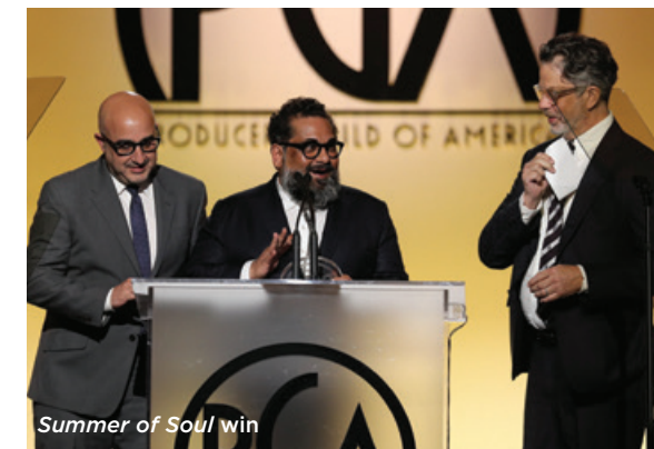
Summer of Soul win